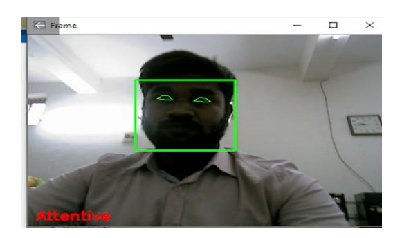
Fig-3 Result and Discussion Diagram

The work at hand provides a solution to the problem of taking into account the understudy in the ongoing online e-learning meetings, as the circumstances surrounding the coronavirus prevent the teachers from giving each understudy the attention they would normally give in a traditional classroom. Through this work, a technique that can help with student monitoring on e-learning platforms has been proposed. This methodology uses a variety of conduct sections to investigate the understudies' levels of consideration throughout an online learning session. The outcome of the three parts feeling location, sluggishness discovery and head-present assessment separates the understudies into 3 unique levels: exceptionally mindful, normal, or less than ideal throughout the stretch of time of the class. In view of the outcomes, the information is ordered into the classes of yawning, looking, resting