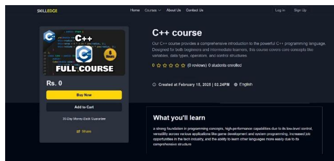
Fig. 5.3 Course Details

Each course page provides detailed descriptions, prerequisites, and syllabus breakdowns. Users can enroll in courses via Razorpay payment integration, ensuring secure transactions. Once enrolled, learners can access video lectures, quizzes, and progress tracking tools.