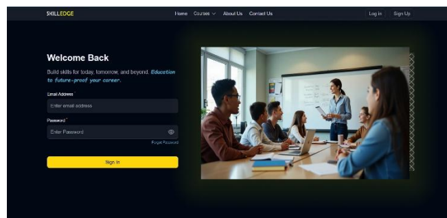
Fig. 5.1 Sign up Page

The sign-up and login pages provide secure authentication using JWT tokens, ensuring data privacy. New users can create an account with basic details, while existing users can log in to continue their learning journey. Error handling and validation enhance user experience by preventing invalid inputs.