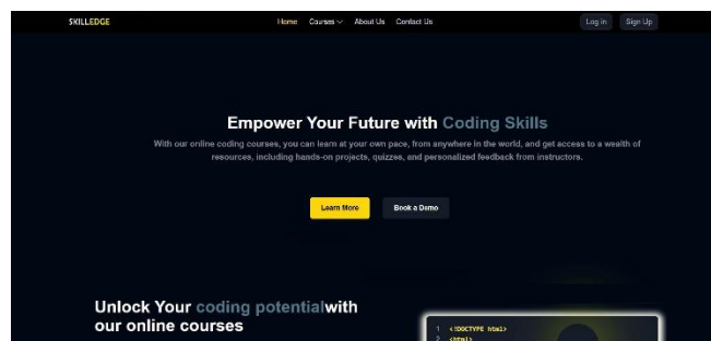
Fig. 5.2 Home Page

The home dashboard presents an intuitive interface where users can explore available courses, view their progress, and access learning materials. A search and filter feature helps users find relevant courses easily. The panel also highlights recommended courses based on user activity.