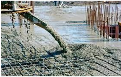
Self-compacting concrete, SCC