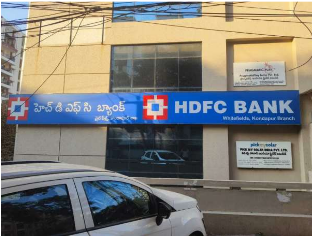
A HDFC branch

In March 2020, HDFC Ltd. (the parent company of HDFC financial institutions) invested ₹1,000 crore in Yes financial institutions. According to the Reconstruction Scheme of Yes financial institutions, 75% of this investment would remain locked in for a period of three years. On 14 March, Yes financial institutions issued 100 crore equity shares with a face value of ₹2 per share, at a price of ₹10 per share (including a premium of ₹8), to HDFC Ltd. This transaction resulted in HDFC holding 8.97% of the post-issue equity shares capital of Yes financial institutions.