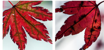
(b) second picture