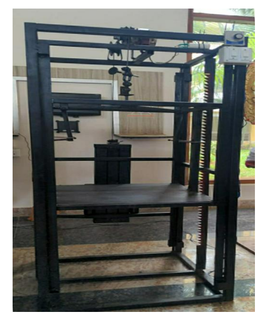
FIG -2: CONSTRUCTION OF SAFTEY ELEVATOR