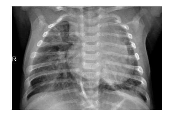
6.2 Covid-19 Detected Xray