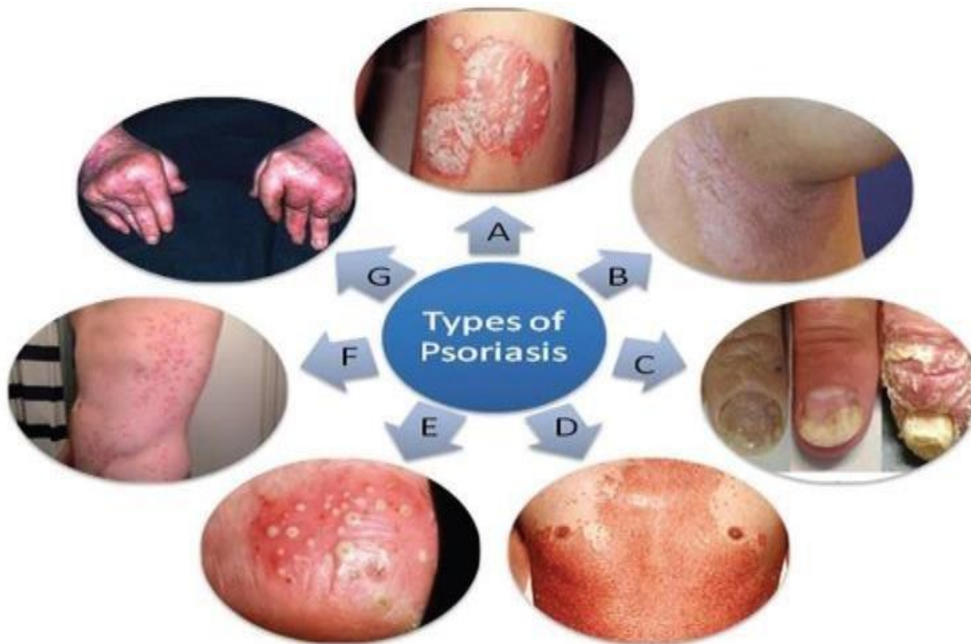
Figure 1: Types of psoriasis. (a) Plaque psoriasis, (b) inverse psoriasis, (c) nail psoriasis, (d) erythrodermic psoriasis, (e) pustular psoriasis, (f) guttate psoriasis, (g) psoriasis arthritis)

It is a rare types of psoriasis that affectsonly3% of people with psoriasis. It can come in two varieties: First, progressive chronic plaque psoriasis which grows in scope and confluent, and second, Erythrodermic which as a result, the body’s thermoregulatory capacity is impaired, resulting in hypothermia widespread inflammation of the body’s surface severe itching, pain, and swelling. This type of psoriasis is potentially fatal.