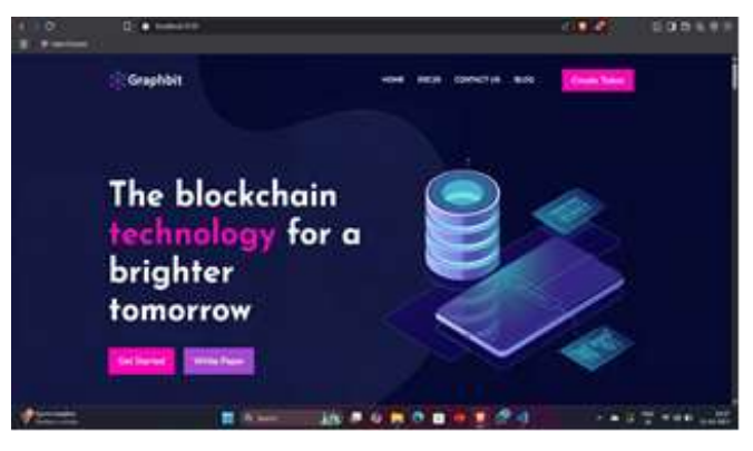
Fig. 4 Home Page Screen 1