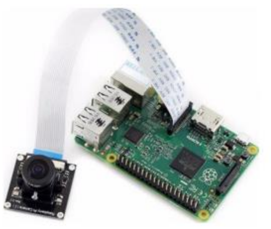
Fig 3. Raspberry Pi Camera Module

In addition to the ultrasonic sensors, the system also makes use of the Raspberry Pi camera module as shown in Fig 3 to capture images of each lane. Each lane has one camera to capture images of the lane. In total four cameras are used for the four paths. The Pi then determines the level of traffic and distributes the time to the light LEDs, which are red, yellow and green LEDs.