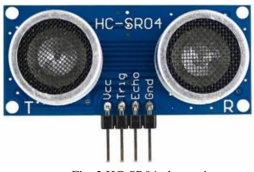
Fig. 2 HC-SR04 ultrasonic sensor

These sensors can be used to determine the presence of an obstacle, which in our case is vehicles. Each track has three equally spaced sensors placed vertically on the divider. A total of 12 ultrasonic sensors are used for the four paths. These sensors are connected to the Raspberry Pi using jumper cables and the Raspberry Pi processes the data collected by the sensors.