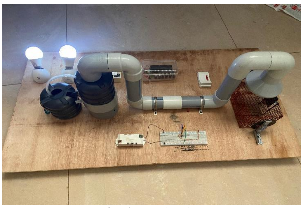
Fig -1: Combustion

The waste-to-energy (WtE) concept, which involves burning waste to produce electricity, is based on the idea of using combustion to extract energy from waste materials. It involves collecting solid waste that are to be burnt in a chamber. The burning of waste is performed inside the chamber and the heat is harnessed to generate electricity