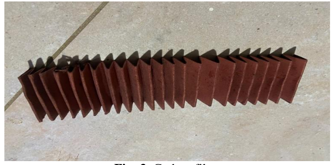
Fig -3: Carbon filter

It is important to make sure that we don't contaminate and pollute the environment while producing electricity. Therefore, the smoke produced as a consequence of burning is sucked by a fan through a pipe passage where it is filtered by a carbon filter without releasing it into air. This will filter out the harmful content out of smoke and helps in reducing their impact to the environment. Further, smoke is filtered again in a tank using charcoal layer by dissolving it into water[10]. This filtered water is again reused. The water is cooled using Peltier module and heat thus produced is pumped out.