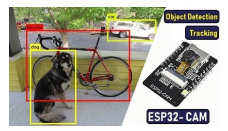
Fig 7: Object Detection

• Objection Detection: This is a Technique which detects the object captured by camera and identifies the object and its location. In Trinal Optics this is useful for the user to understand the his/her surrounding better even in the places which are new for them.