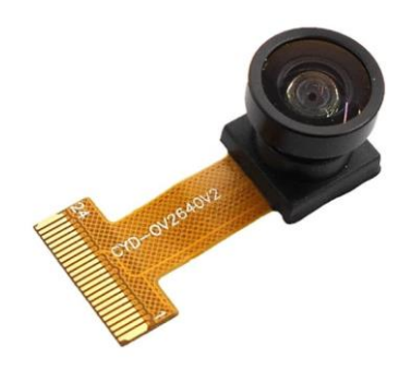
Fig 3: ESP-32 Camera

• Camera: Camera is used to capture the image in front of the user for the object detection/ reorganization process. This Camera suits for Iot application, thus we have used in our project