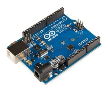
Fig 5: Arduino UNO

• Arduino UNO: This is used for its variety of features in one place such as Bluetooth for earphone in this project, USB port, GPIO pins; it's a special type of microcontroller. It has both software and hardware work to make a device, and its cost efficient too.