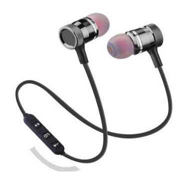
Fig 4: Bluetooth Earphones

• Bluetooth Earphone: These earphones will be get linked via Bluetooth which is inbuilt in Arduino Uno. That will help user to hear the audio messages/ commands