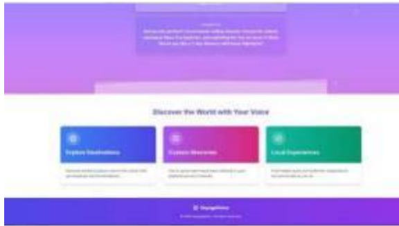
Figure 3. Recommendation and Itinerary