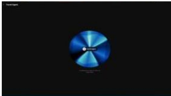
Figure 4. AI Chatbot