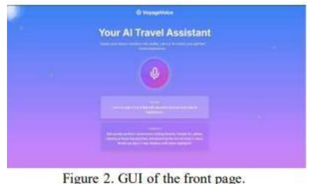
Figure 2. GUI of the front page.