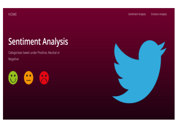
Fig. 3 Sentiment Analysis