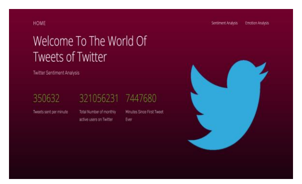
Fig. 2 Welcome Page