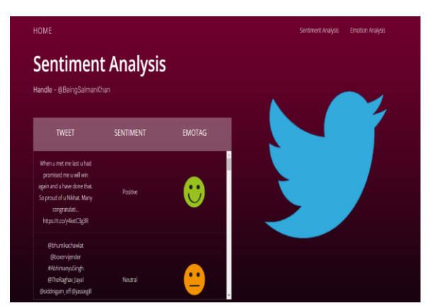
Fig. 4 Sentiment Analysis Result