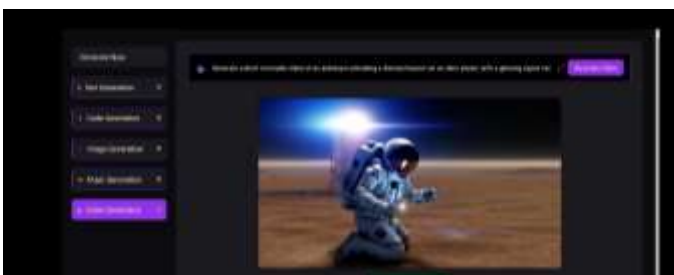
Fig. 5 Video Generation