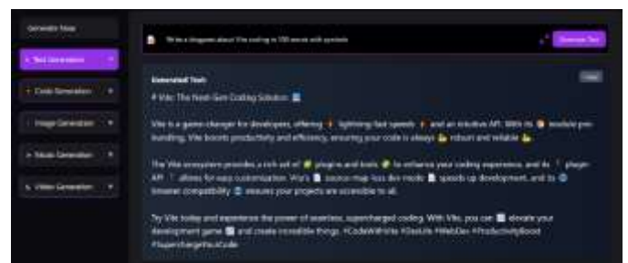
Fig. 2 Text Generation