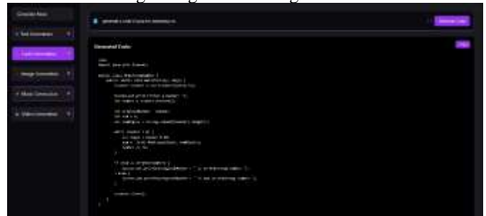
Fig. 6 Code Generation