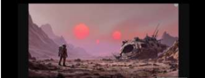
Fig. 3 Image Generation

By integrating tools such as Replicate AI and Stable Diffusion , Univora enables users to convert textual descriptions into visually compelling images. It supports creative designs for marketing, UI/UX concepts, social media graphics, and product visuals.