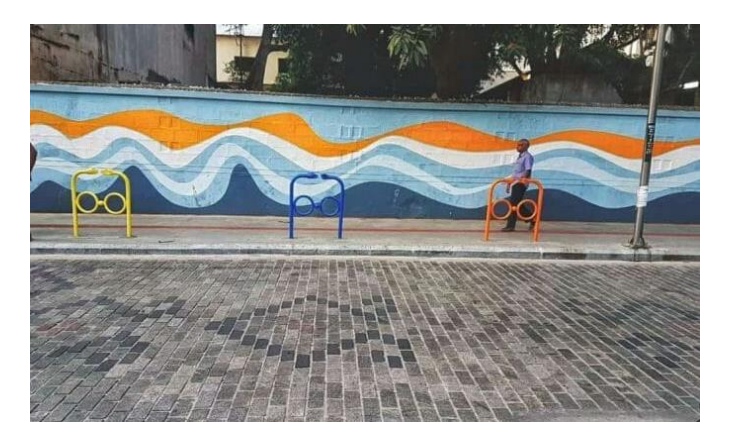
Figure -3 : Pavements that allow ground water recharge

If the pavements are impervious then it does not allow water to infiltrate and prevents evapotranspiration. Hence making the sidewalks pavements pervious will help in reduction of temperature at a considerable rate and it also helps in ground water recharge. (case: Church St Bangalore)