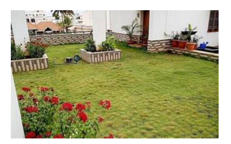
Figure -2 : Green Roof Terrace

It is popularly known as rooftop garden, it's a vegetation layer grown on a rooftop. It provides shade and removes heat from the air by the process of evapotranspiration thereby reducing the temperature of the roof and the surrounding air. It also decreases the run off duration and keeps city cooler for a longer period.