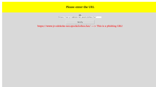
Figure 3: Example for detection of phishing url