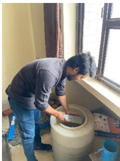
Fig :-9 water absorption test