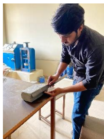
Fig:-10 shape and size test

In this test, a brick is closely inspected. It should be of standard size and its shape should be truly rectangular with sharp edges. For this purpose, 3 bricks are selected at random and they are stacked length wise, along the width and along the height