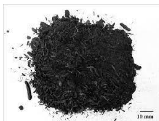
Fig -3: sugarcane bagasse ash