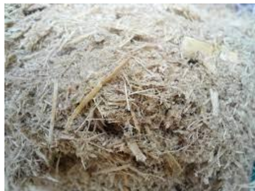
Fig-1: Sugarcane Bagasse

content and moisture-retaining properties, While the combustion of bagasse in sugar mills does contribute to carbon emissions, it is important to note that the carbon released during combustion is part of the carbon cycle. The carbon dioxide emitted has already been absorbed by the sugarcane during its growth, making the overall carbon footprint of the sugar industry relatively neutral. This aspect, combined with the utilization of bagasse for energy generation, contributes to the environmentally-friendly nature of the sugar industry as a whole. Efforts continue to further optimize bagasse utilization, improve energy efficiency, and explore additional value-added applications for this valuable by-product of the sugarcane industry.