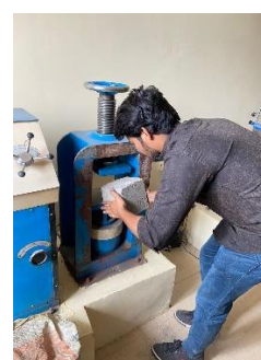
Fig :-8 compression test

The brick specimens are immersed in water for 24 hours. The specimen is placed in compression testing machine with 6 mm plywood on top and bottom of it to get uniform load on the specimen. Then load is applied axially at a uniform rate of 10 N/mm 2 . The crushing load is noted for the bricks named 4, 6, and 8.