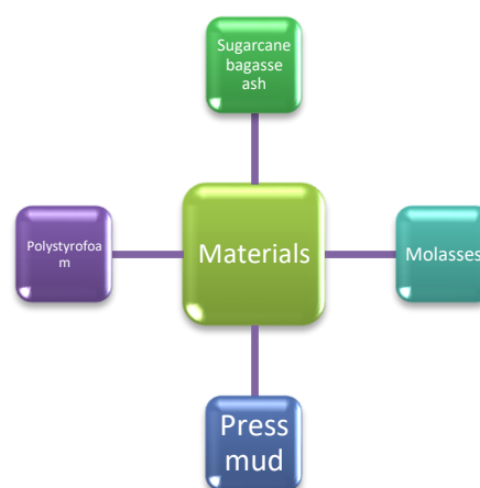
Fig. 2 Flowchart Represent materials