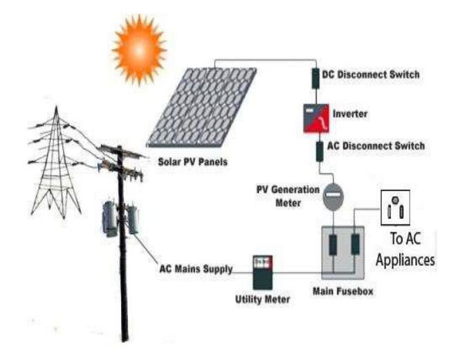
Fig 1: Schematic diagram of proposed system