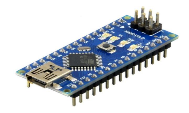
Figure 1: ARDUINO NANO

like input/output pins for connecting sensors and actuators, USB connectivity for programming, and it can be powered via USB or an external power source. With the Arduino Nano, you can bring your creative ideas to life and learn about electronics and programming along the way. It can control various electronic projects such as robots, sensors, and lights. With its built-in features like input/output pins and USB connectivity, it's easy to program and experiment with. It can be powered via USB or external sources, making it versatile for different setups. Overall, the Arduino Nano empowers users to bring their creative ideas to life while learning about electronics and programming.