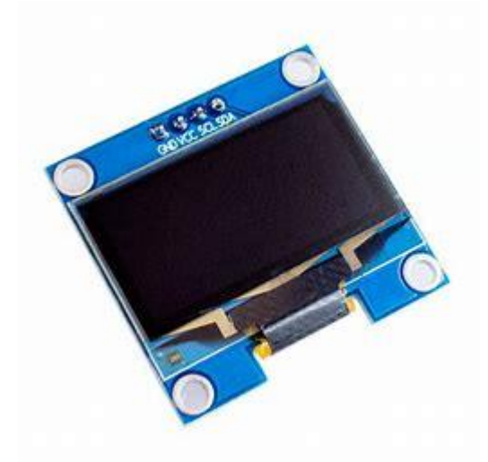
Figure 3: OLED

OLED (Organic Light-Emitting Diode) is a display technology featuring organic compounds that emit light when an electric current passes through them. Unlike traditional LCDs, OLEDs do not require a backlight, allowing for thinner and more flexible displays with better contrast and faster response times. They offer vibrant colours, deep blacks, and wide viewing angles, making them ideal for applications like smartphones, TVs, and wearable devices.