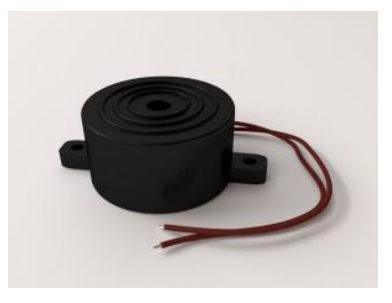
Figure 6: Buzzer

A buzzer is an electromechanical component commonly used for generating audible alerts, notifications, or alarm sounds in electronic devices. It consists of a small metal or plastic housing containing a piezoelectric element or an electromagnetic coil. When an electric current is applied to the buzzer, the piezoelectric element vibrates or the electromagnetic coil moves, producing sound waves in the audible range.