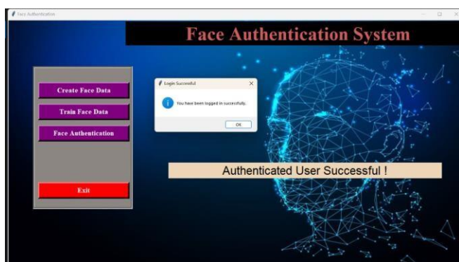
Fig 3. Result