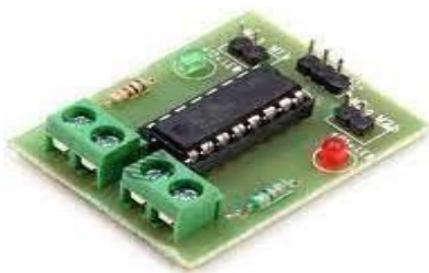
Fig 4: L293D ( Motor Driver )

A motor driver is an integrated circuit chip which is usually used to control motors in autonomous robots. Motor driver act as an interface between Arduino and the motors . The most commonly used motor driver IC's are from the L293 series such as L293D, L293NE, etc. These ICs are designed to control 2 DC motors simultaneously. L293D consist of two H-bridge. H-bridge is the simplest circuit for controlling a low current rated motor. We will be referring the motor driver IC as L293D only. L293D has 16 pins.