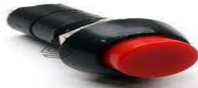
Fig: 5 Switch( pushbutton )

switching mechanism. They come in a variety of shapes, sizes, and configurations, depending on the design requirements.