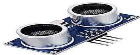
Fig:2 Ultrasonic sensor

Ultrasonic sensors are used primarily as proximity sensors. They can be found in automobile selfparking technology and anti-collision safety systems. Ultrasonic sensors are also used in robotic obstacle detection systems, as well as manufacturing technology. In comparison to infrared (IR) sensors in proximity sensing applications, ultrasonic sensors are not as susceptible to interference of smoke, gas, and other airborne particles