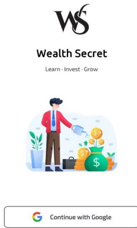
Figure 2: Login Credentials

strategies, confirming that "Wealth Secret" meets its objectives of delivering a robust, secure, and user-friendly trading platform.