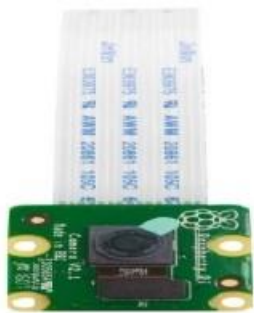
Figure: Raspberry Pi Camera

In addition to automatic band filtering, automatic exposure control, automatic white balance, automatic luminance detection at 50/60 Hz, and automatic black level calibration are all included in the camera module. With measurements of 23.86 x 25 x 9 mm and a weight of 3g, it functions within a temperature range of -20° to 60° for stable images.