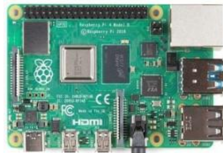
Figure: Raspberry Pi Microcontroller Board

A flexible option for developers wishing to work with microcontrollers, the RP2040 microcontroller supports MicroPython as well as C/C++. In cases where a Raspberry Pi's power is not needed for simpler projects, it's a great substitute for Arduino in cases where using the Arduino platform is not preferred.