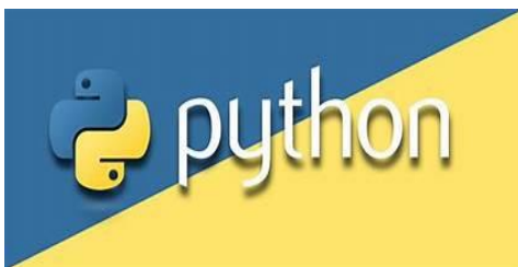
Figure : Python Language