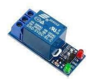
Fig 7: Relay

As shown in the fig 7, Relay module acts as an automatic power switching circuit which is operated by electromagnet. When the relay module is energized or activated by DC, electromagnet pulls the circuit to either open or closed. The single channel 5V relay module consists of a coil and two contacts that is normally open (NO) and normally closed (NC).