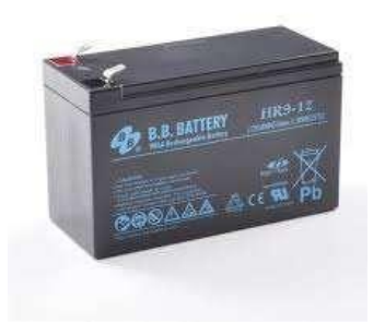
Fig 2: 12V Battery

As shown in the fig 2, Power supply is used to energies the equipment's such as microcontroller, relay, level converter, GSM, and GPS module. The power supply is used to energies the whole module. The power supply can be in the form of wired or battery. In our project 12V battery is used as a power supply.