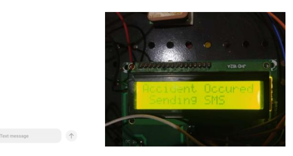
Fig 13: Notification of accident

As shown in the fig 13, results show the co-ordinates of the location where the accident happened. This information is useful to provide immediate help to the person who is injured as the details would be sent to their respective family members, emergency services.