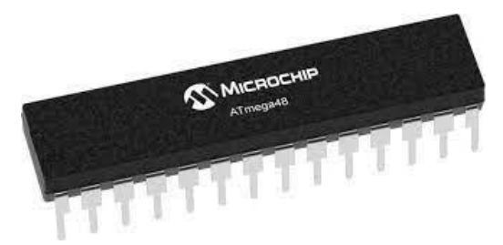
Fig 1: ATmega48 micro-controller

As shown in the fig 1, ATmega48 is an 8-bit micro-controller from the Atmel AVR family. It is designed to be a low-power, high-performance device for a variety of embedded applications. The ATmega48 has 4KB of Flash memory for storing program code, 512 bytes of SRAM for data storage, and 256 bytes of EEPROM for non-volatile data storage. It also has a 16MHz clock speed, which provides fast and responsive operation.