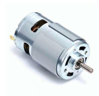
Fig 8: DC motor

As shown in the fig 8, A DC motor is any of a class of rotate electrical motors that converts direct current (DC) electrical energy into mechanical energy. The most common types rely on the forces produced by induced magnetic fields due to flowing current in the coil. Nearly all types of DC motors have some internal mechanism, either electro-mechanical or electronic, to periodically change the direction of current in part of the motor.