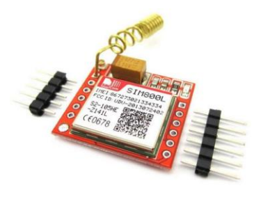
Fig 4: GSM module

As shown in the fig 4, GSM is used to send data from control unit to base unit. We can use GSM 300 which operates at frequency 900MHz. It has up link band of 890MHz to 915MHz and down link Band of 935MHz to 960 MHz GSM takes advantages of both FDMA & TDMA. In 25MHz BW, 124 carriers are generated with channel spacing of 200 KHz (FDMA). Each carrier is split into 8 time slots (TDMA). At any given instance of time 992 speech channels are made available in GSM 300.