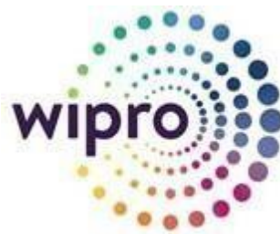
Figure 5.2: Wipro Limited