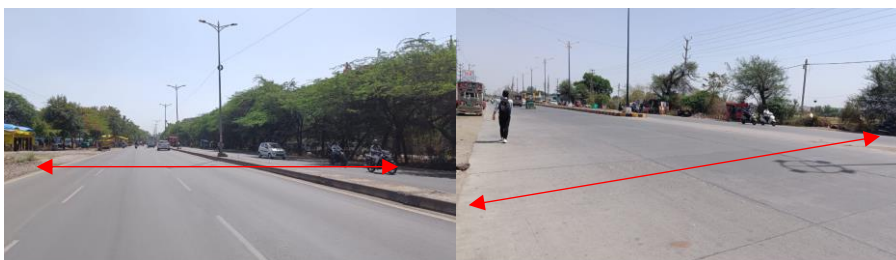
Image of road - Bhawarkua to Tejaji nagar